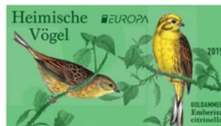
GERMANY Heimische Vogel